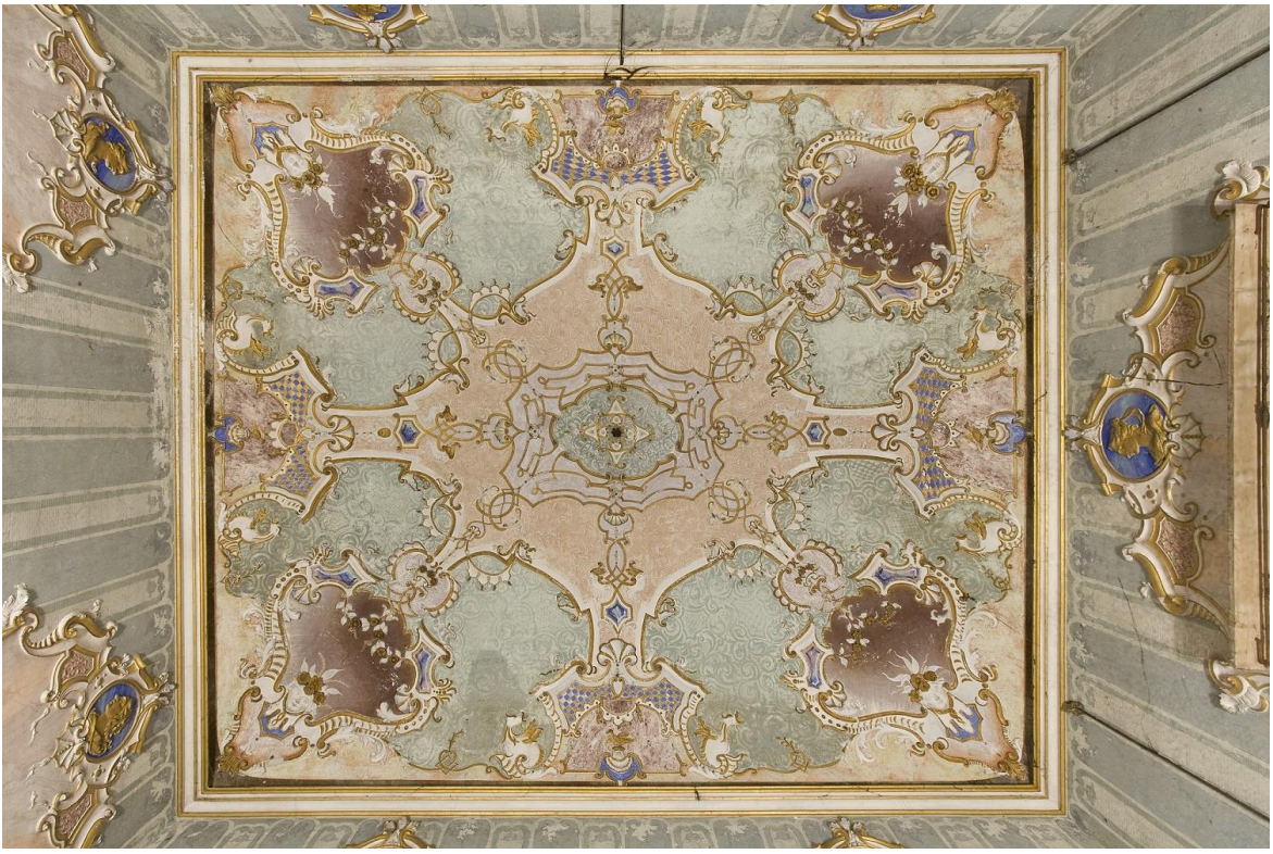
The enchanting ceiling of the Sala Turchina

The apartment is completed by a small vestibule, recently transformed into a bathroom. Even at the time this environment was certainly used as a hallway, where the servants dealt with dressing the nobles before the social occasions.